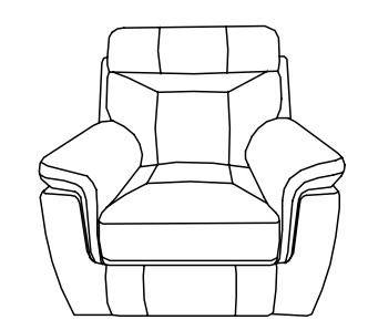
CARE INSTRUCTION FOR LEATHER GEL MATCH FURNITURE: